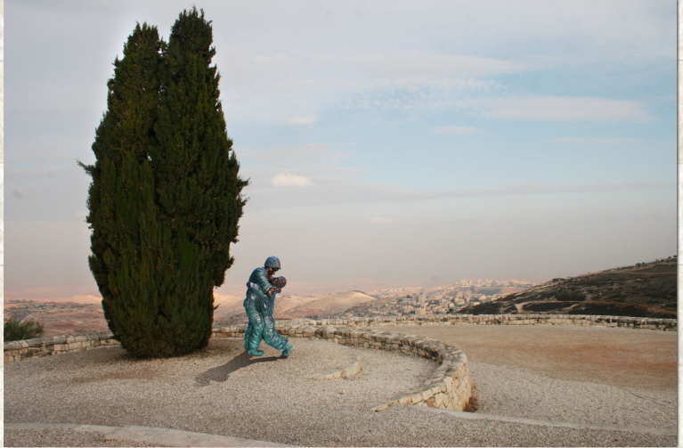
West-facing the Hebrew university מערב-משקיף על האוניברסיטה העברית